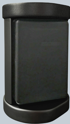
R3S-10 on mounting bracket 120°